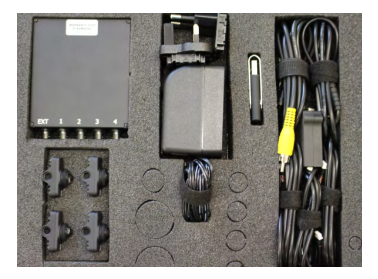
System kit part number: 110-3417